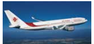
Airbus A330 CF6-80, PW4000, Trent 700