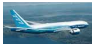
Boeing 777 GE90-115B, PW4000