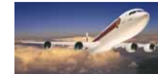
Airbus A340 CFM56, Trent 500