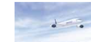
Airbus A350 Trent XWB