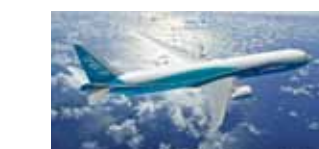
Boeing 767 CF6-80