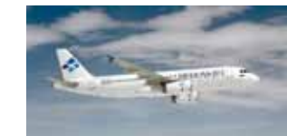
Airbus A320 CFM56, V2500