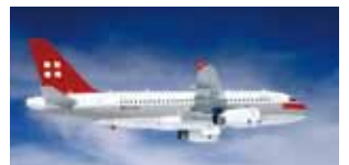
Airbus A319 CFM56, V2500