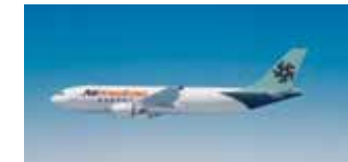
Airbus A300 CF6-80, PW4000