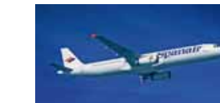
Airbus A321 CFM56, V2500