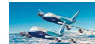
Boeing 747 GE90, CF6-80, PW4000