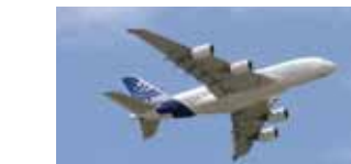
Airbus A380 GP7000, Trent 900

Aircraft in which Volvo Aero is involved, as engine or engine component manufacturer, or MRO supplier