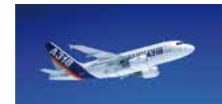
Airbus A318 CFM56, PW6000