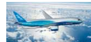
Boeing 787 GE90, Trent 1000